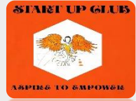
Start-Up Entrepreneurship Club