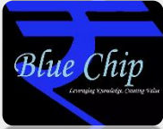
Blue Chip Finance Club