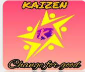
Kaizen HR Club